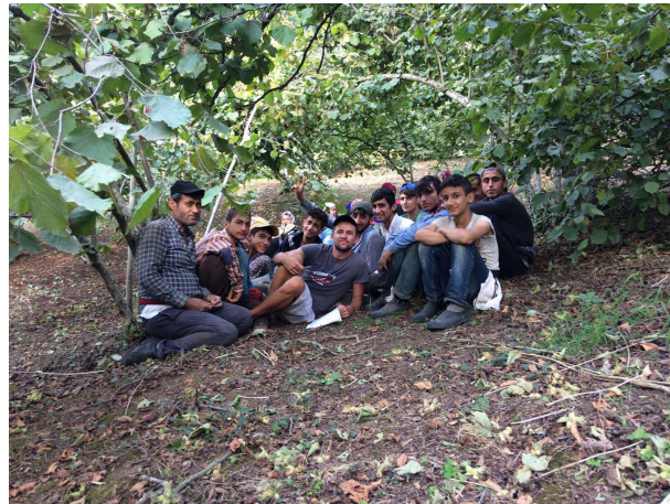
FLA monitors interview hazelnut workers in the Düzce region of Turkey.

In the 2017 assessment period, the FLA found that 12 percent of workers at the visited farms were underage (younger than 16) – similar to FLA findings in 2016 (11 percent). Despite the companies' efforts to strengthen interventions and build child labor remediation programs, the results show the challenges in improving deeply rooted systemic issues, especially with a largely migrant family workforce. The results suggest that company efforts must continue and must be strengthened. This report also indicates the continued need for progress in other areas like hours of work, wages, discrimination against migrant workers, transportation safety, and working conditions of young workers.