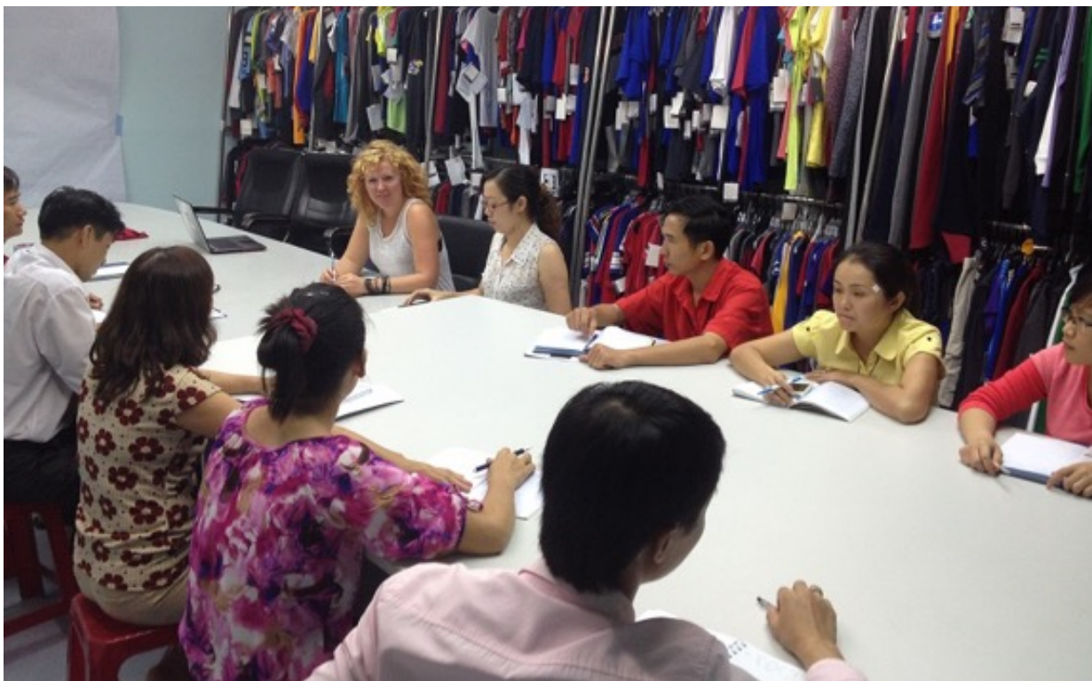
Colosseum staff members meeting with union at The Cotton Shop

Colosseum created the Country Analysis and Engagement Strategy and Procedure document in 2015. The Compliance Manager updates the document at least once per year to reflect new internal audit data, sourcing decision changes, and potential CSO consultation opportunities. The document is also updated if a new sourcing country is considered or added. The Compliance Manager has mapped stakeholders in relation to Colosseum's business, identifying key stakeholders relevant to Colosseum's compliance program.