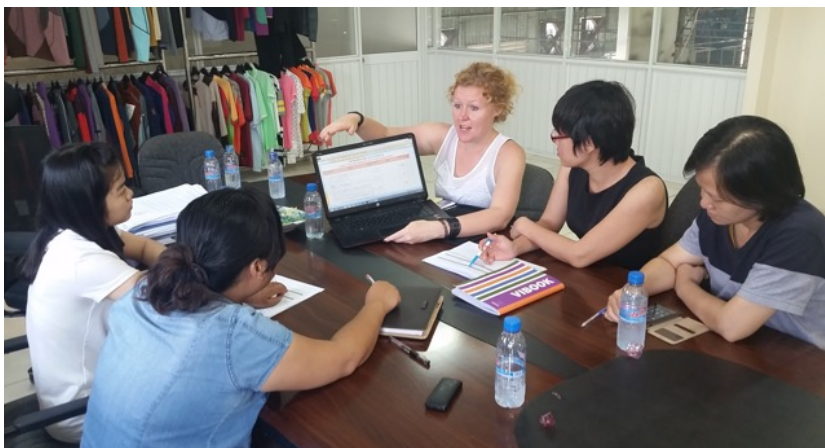
Colosseum Compliance staff training a factory on the Colosseum Factory Compliance Guide

Colosseum has worked to develop sophisticated offline tools using Microsoft Access for its factory assessments and remediation action data analysis. The database houses all factory profile information, audit data, root cause analysis, Corrective Action Plans (CAPs), remediation