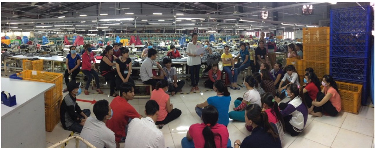
Code of Conduct Training in the Sewing Department at The Cotton Shop in Vietnam

This team is relatively new to the social compliance field, particularly at the factory level. Each team member has a dual role within the management of TCS. For example, the Compliance Coordinator is also the Chief Accountant for TCS. All staff members working to support the Chief Accountant, in his new compliance role, have additional jobs supporting import/export and human resources functions of TCS. There is a concern about how the new team will prioritize TCS's social compliance needs while balancing other business needs. The FLA recommends developing the new compliance team through a series of compliance-focused trainings with the goal of enhancing the effectiveness and implementation of TCS's social compliance program.