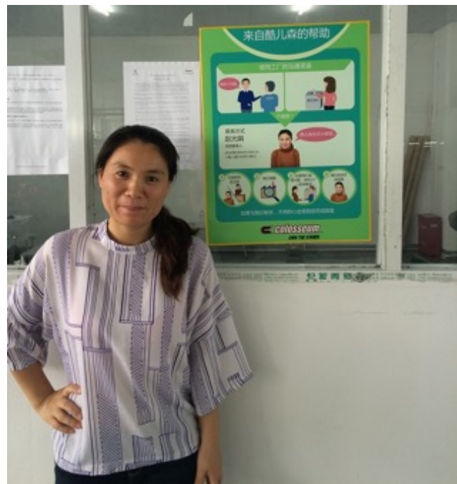
Colosseum Compliance staff member exhibiting poster on Grievance Channel

While Colosseum provides annual training on the grievance mechanisms through a consistent effort from Colosseum's Shanghai Compliance Coordinator, it remains a challenge to ensure that grievance mechanisms are functioning effectively. Colosseum has guided factories to establish a feedback mechanism that will allow worker responses to inform the process of future trainings and encourage broader use. However, the implementation of such feedback mechanisms at the factory level is, in large part, the daily responsibility of the factory. The FLA provided recommendations to Colosseum to improve grievance mechanisms to measure effectiveness and ensure accountability.