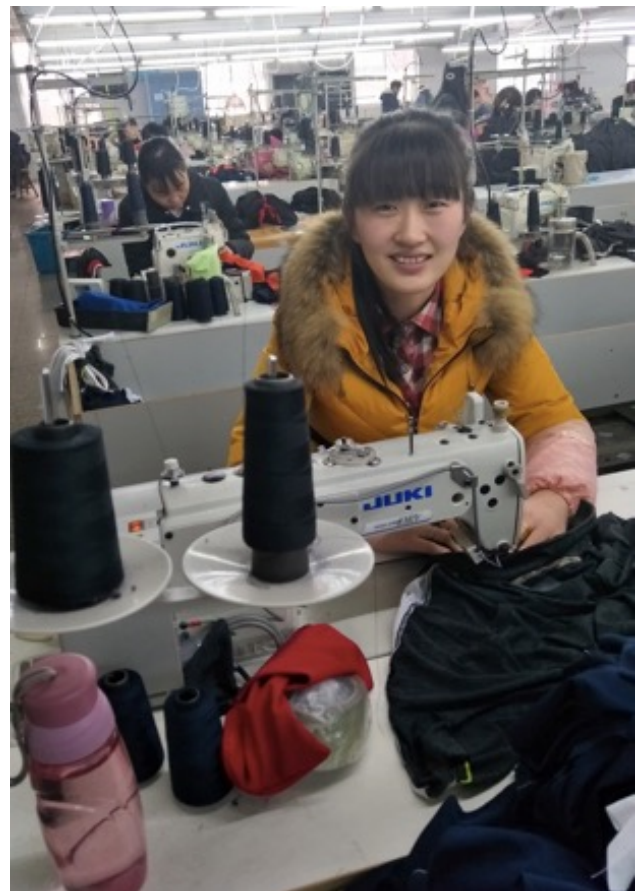
A factory worker at one of Colosseum's contract facilities. This facility is participating in a project that teaches workers how to use photography.

Colosseum continues to grow its business and is looking at carefully expanding its supplier base while maintaining long-term relationships with key suppliers. The FLA supports Colosseum's efforts to continually seek new and creative processes and initiatives to incentivize suppliers to uphold Colosseum's commitment to responsible purchasing and planning across its supply chain.