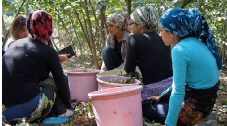
FLA assessors interview hazelnut workers in the Düzce region of Turkey.

From August 17 to 27, the FLA and external assessors conducted independent assessments of 51 farms in Sakarya and Ordu for Olam's supply chain, and 48 farms in Düzce for Balsu's supply chain. The assessment team visited a total of 99 farms. They followed the FLA's Independent External Monitoring (IEM) methodology, which has four main components: (1) internal monitoring center visits of Balsu and Olam Progida offices, (2) farm visits, (3) profiling visits to camps, schools, and communities, (4) external stakeholder consultations.