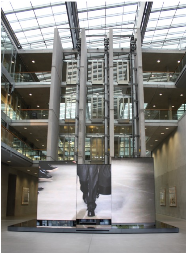
The runway show projected at the Hugo Boss' Headquarters.

As part of the financial terms and to uphold Hugo Boss Social Standards in Compensation, all suppliers have a wage clause in their contract which stipulates that they are responsible for maintaining trained workers at a high-quality standard and to do so, they need to pay workers premium wages. Hugo Boss verifies the premium wages through wage data collection during the audit process. FLA recognizes Hugo Boss' financial terms on the wage clause and the financial responsibility Hugo Boss owns on material procurement for FOB and CMT suppliers as strengths of Hugo Boss' purchasing practices.