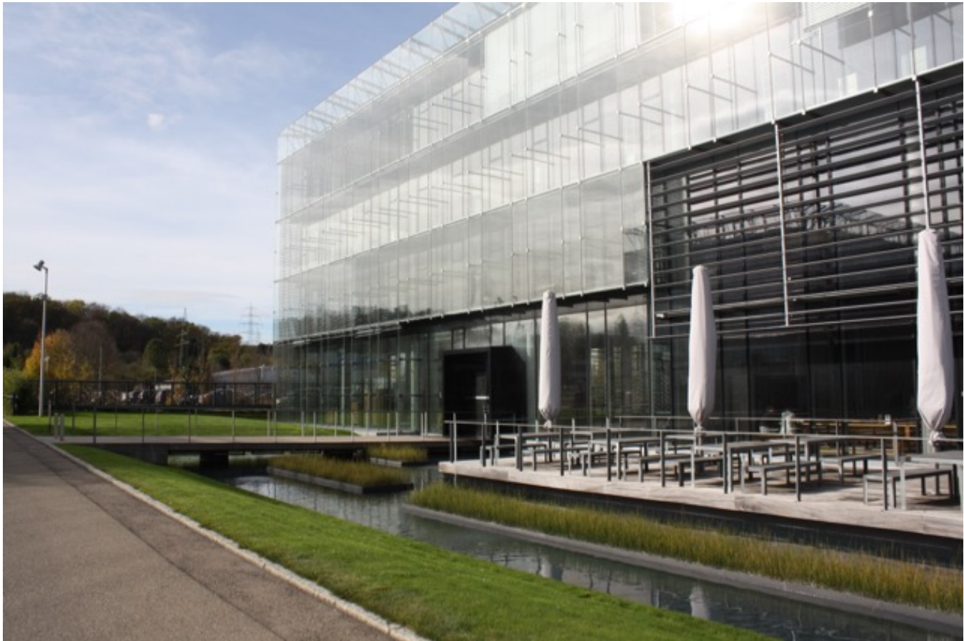
Hugo Boss Headquarters in Metzingen, Germany.