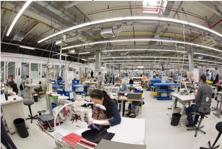
Hugo Boss production employees at the Metzingen production facility.

For contract facilities, as part of the audit process, Hugo Boss auditors provide contact information to interviewed workers on the Hugo Boss communication card; workers can submit grievances to a provided hotline via phone or text via email to Hugo Boss at vendor_sustainability@hugoboss.com . This channel has been utilized by workers; in one case, a worker submitted a complaint on delayed payment of wages. Hugo Boss investigated issue and found that the supplier required further support to be more financially stable. Hugo Boss provided further recommendations for the supplier to achieve financial stability; however, the supplier refused to take actions on these recommendations.