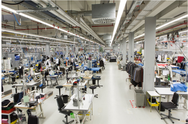
The production floor at Hugo Boss' Metzingen production facility.

In 2015, FLA received a Third Party Complaint from Teksif Union, a local textile workers' union, alleging Freedom of Association violations at Hugo Boss' production facility in Izmir, Turkey. The specifics of the complaint are further discussed under Principle 9. As a follow-up to the investigation, Hugo Boss hired a mediator to provide training on worker rights and improve industrial relations at the facility. HR and factory management personnel were required to participate in Freedom of Association training, which focused on law and practice regarding improving relations with the union and legal practices in industrial relations. FLA interviewed the mediator, who reported that over 350 Hugo Boss management staff have been trained at the Izmir facility. Additionally, FLA reviewed documentation from the training. FLA recommends Hugo Boss continue to assess the Freedom of Association training needs of Izmir management and provide training opportunities to staff.