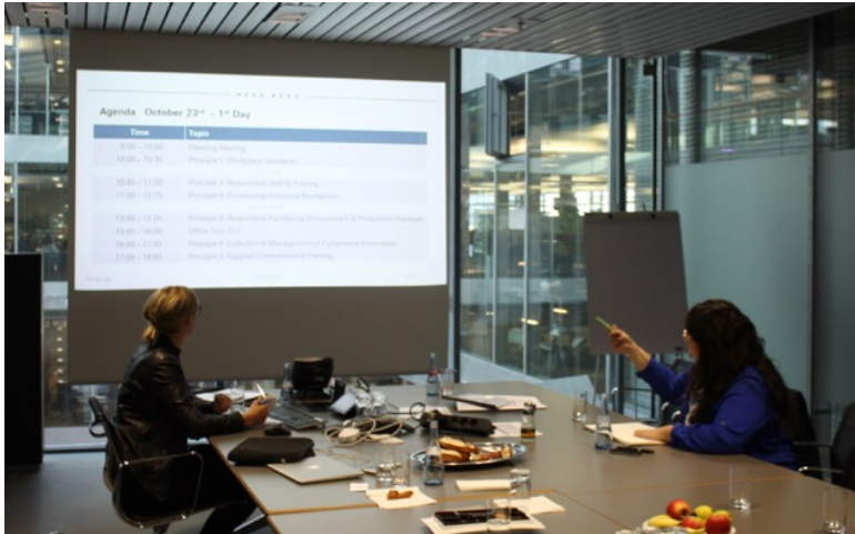
Hugo Boss' Team Leader, Vendor Sustainability and FLA's Program Manager, Business Accountability in discussion during the HQ Assessment for Hugo Boss.

the Social Standards Team provide guidance to management on the CAP and, when allowed, record the closing meeting so that the supplier can have an audio recording of the guidance provided by the Social Standards Team