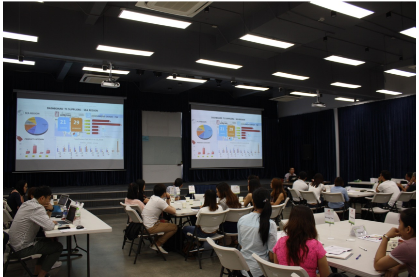
FLA staff observed representatives from suppliers participating in New Balance's CSR Alliance in Vietnam.