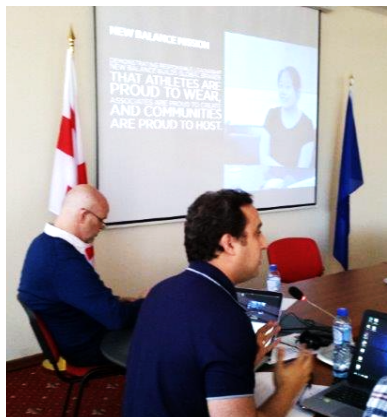
New Balance's Compliance Manager, EMEA presents on New Balance's program to the Republic of Georgia's Ministry of Labor.

labor, to speak at its Global Compliance Team summit. FLA recommends New Balance continue its outreach and engagement to civil society organizations in Thailand and other high-risk countries.