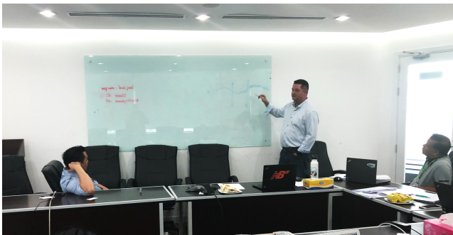
New Balance's Managing Director, Footwear Sourcing for Asia explains the dynamics of New Balance's Flexible Supply Chain SOP to FLA staff during the Vietnam Field Office Visit.

continue to facilitate supplier feedback in a transparent manner and to improve purchasing practices based on supplier feedback to mitigate negative impacts on workers.