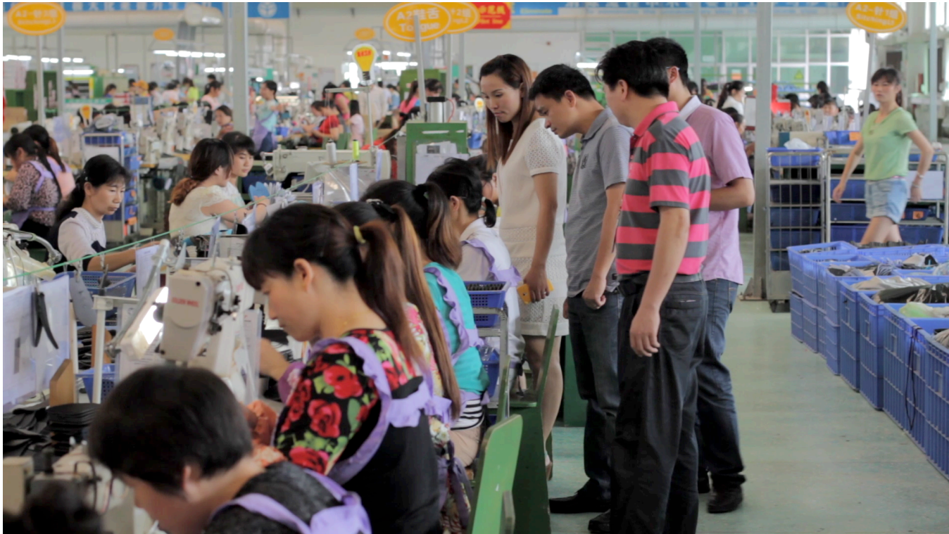
New Balance’s Global Compliance staff conduct a factory walk-through as part of New Balance’s Sprint Audit.