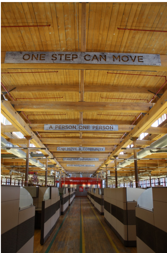
New Balance’s Office at the Lawrence Facility in Massachusetts, USA, with the quote: “One step can move a person, one person can move a community, and one community can move the world.”

FLA commends New Balance’s work to review working conditions throughout its supply chain and recommends New Balance continue to develop and implement projects and accountability programs, in collaboration with other brands and industries, to ensure that workers’ rights are upheld throughout New Balance’s supply and value chains.