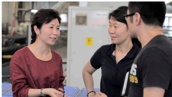
New Balance's Director of Global Compliance, Asia engages with factory management during the audit process.

needs as well as systemic improvements in New Balance's purchasing practices. The Value Chain and Global Compliance Departments communicate together with their suppliers on the expectation that they uphold the workplace standards and coordinate with New Balance on production practices. The FLA conducted interviews with the planning and purchasing staff and the Executive Vice President, Value Chain, and verified that there was comprehensive knowledge on the Global Compliance program's operations and standards that are affected by New Balance's purchasing practices, such as practices in forecasting and supplier evaluations. Additionally, during the interview with New Balance's Executive Vice President, Value Chain, the FLA noted the EVP's emphasis on supplier engagement to improve working conditions as a strength in communicating to and training relevant staff. The FLA recommends New Balance continue to ensure informal trainings and learnings from discussions are applied to improve New Balance's purchasing practices, and consider developing a formal responsible purchasing practices training, especially for relevant new hires in the Value Chain Department.