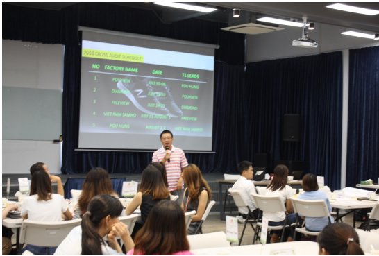
New Balance's Lead Compliance Specialist & Analyst discusses the cross audits suppliers will conduct together during the CSR Alliance observed by the FLA in Vietnam.

participation in these programs. Because these programs require long-term implementation, if a supplier's Sprint Audit drops below a four-star rating for one quarter, the supplier will be allowed to continue the Marathon Program but will lose their Marathon points until the Sprint score improves again. The FLA reviewed the early stages of the scoring, the qualification process, and the Q2 2018 scores for the six suppliers who had implemented the energy and fire safety modules.