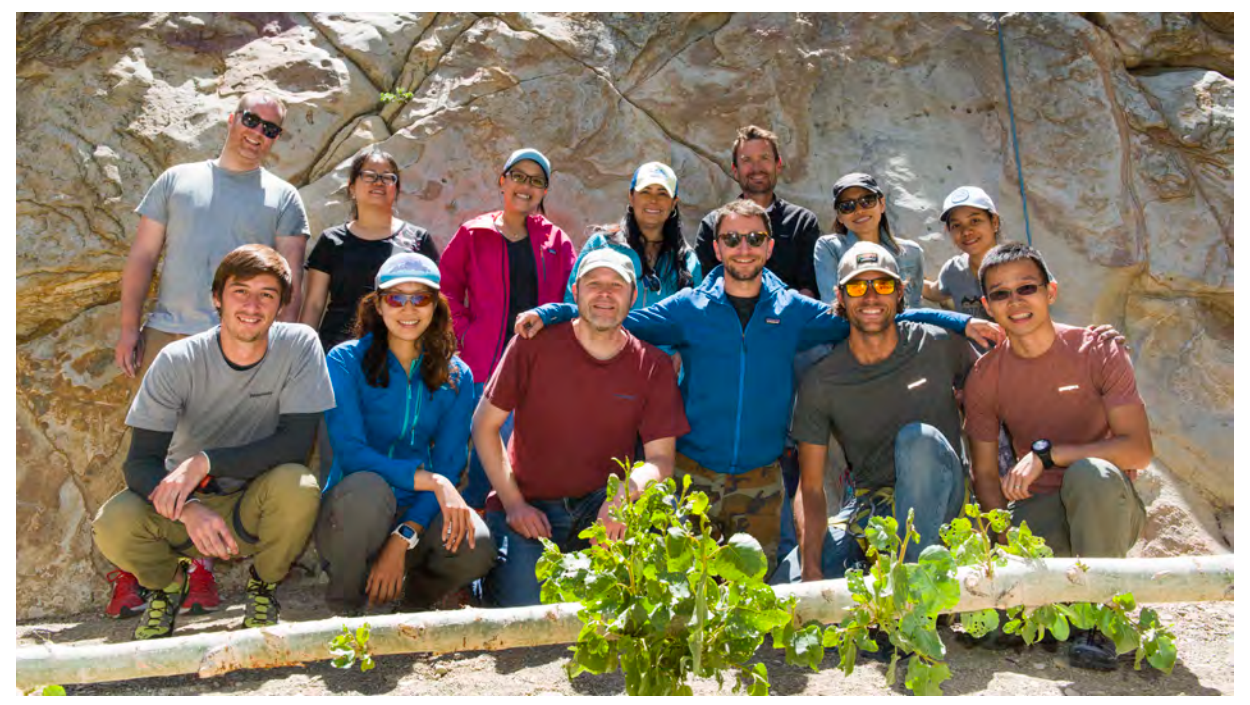
Patagonia's SER Team photo during its annual SER summit in Ventura, CA.

FLA reviewed Patagonia's focused assessment on grievance mechanisms whose piloting began in 2016. FLA also reviewed how Patagonia prioritized its grievance assessments, focusing on suppliers that needed further support in developing functioning grievance systems. FLA also reviewed how Patagonia tracks the grievances submitted through its confidential hotline and found that workers are submitting grievances related to labor violations, such as supervisors not signing worker resignations or concerns on social insurance benefits. When Patagonia receives a grievance through this channel, it works with the supplier to address the grievance and to also improve the supplier's internal grievance mechanisms so that the supplier can manage its own workers' grievances. FLA noted Patagonia's focused review of grievance mechanisms and the support Patagonia provides to its suppliers as a key improvement from the 2013 Reaccreditation.