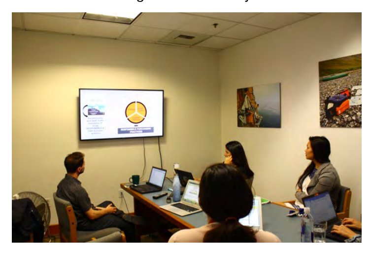
Patagonia's SER Team and FLA staff review Patagonia's implementation of Principle 8: Responsible Purchasing Practices at the HQ Assessment in April 2017.