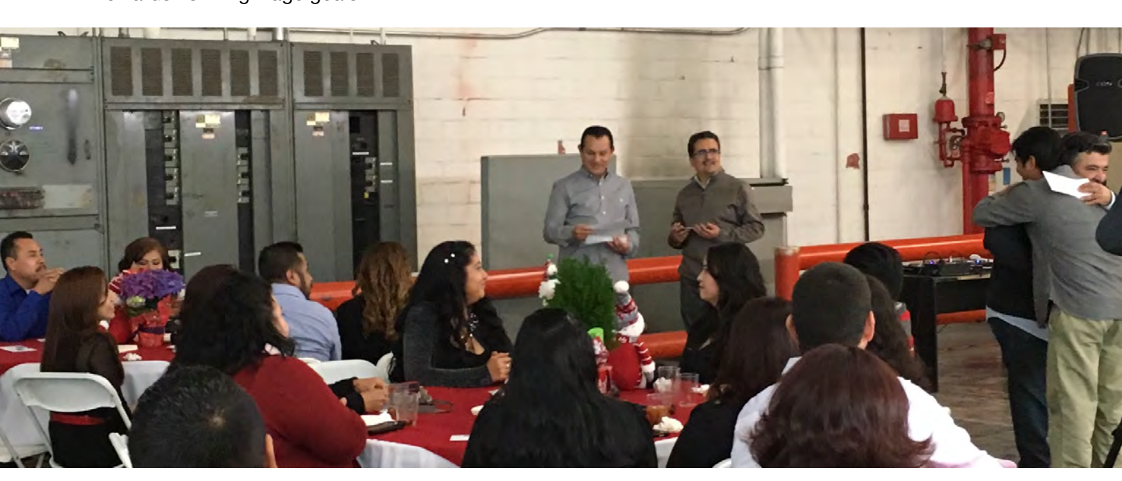
Disbursement of the Fair Trade USA premium check at a Patagonia T-Shirt supplier in Los Angeles, CA.

Patagonia has expanded its Fair Trade certification program substantially since the last FLA reaccreditation to include all men's board shorts and women's swimwear and has developed this video to inform consumers on their Fair Trade certification program. As part of the program, Patagonia has committed to paying a premium on goods produced in Fair Trade USA Certified factories. In turn, these factories must organize a workers' committee to review and decide how the premium is to be distributed. Workers can vote to receive the premium as a cash bonus, they can choose various projects, investments, or other needs that would benefit the workers. This commitment is a first step towards addressing some worker needs while developing a larger, more comprehensive compensation strategy. Patagonia's public commitment to fair compensation has been followed by concrete steps in gathering wage data, improving data analysis, and implementing worker benefit programs. FLA commends Patagonia's commitment in benchmarking its progress towards its living wage goals.