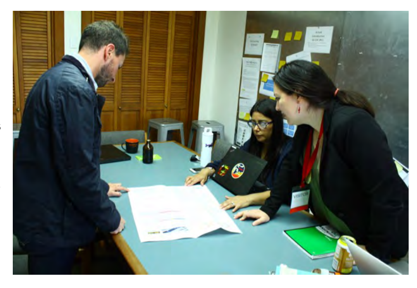
FLA's former Associate Director, Business Accountability reviews with Patagonia's Senior Manager of Supply Chain Social Responsibility & Traceability and Manager of Finished Goods Social Responsibility the dashboard that presents the supplier data for each department of the 4-Fold meetings (Business, Quality, Social Responsibility, and Environmental Responsibility).

certification and FLA Participating Supplier status, and sharing of audit reports with other brands in order to reduce audit fatigue and duplicate and/or conflicting remediation efforts. As mentioned above, FLA recognized that Patagonia had made other efforts that are incentives for suppliers and recommended that Patagonia communicate to suppliers their efforts in providing repeat styles. FLA recognized the collaboration between the 4-Fold meetings as a strength of Patagonia's Responsible Purchasing Practices implementation, and supports Patagonia's efforts to develop a balanced scorecard.