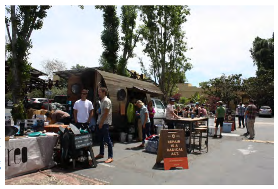
Patagonia's Worn Wear Truck, that offers repair services for Patagonia products, at the Patagonia campus during the HQ Assessment in April 2017.