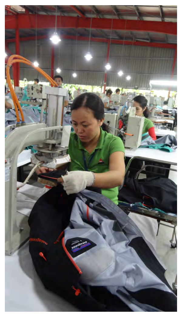
A Patagonia jacket being produced by a worker at a Patagonia supplier in Thai Binh, Vietnam.

Worker Voice & Engaging with Local Trade Unions Systematic engagement with trade unions at Patagonia factories occurs during Patagonia's audit process, with union representatives included in the interview process. In some cases, Patagonia will engage with factory trade unions to discuss specifics on labor issues. FLA reviewed Patagonia's engagement log and found that in 2016 and 2017, Patagonia engaged with five different unions at different factories in their Tier 1 supply chain. Most of these engagements were to further understand how the union operates at the factory and their specific responsibilities and activities. One engagement with a factory trade union was to follow-up on a grievance submitted by the union's president. FLA recognizes Patagonia's engagement with local unions and encourages Patagonia to continue to engage with local unions to understand dynamics within the factory and to address labor issues.