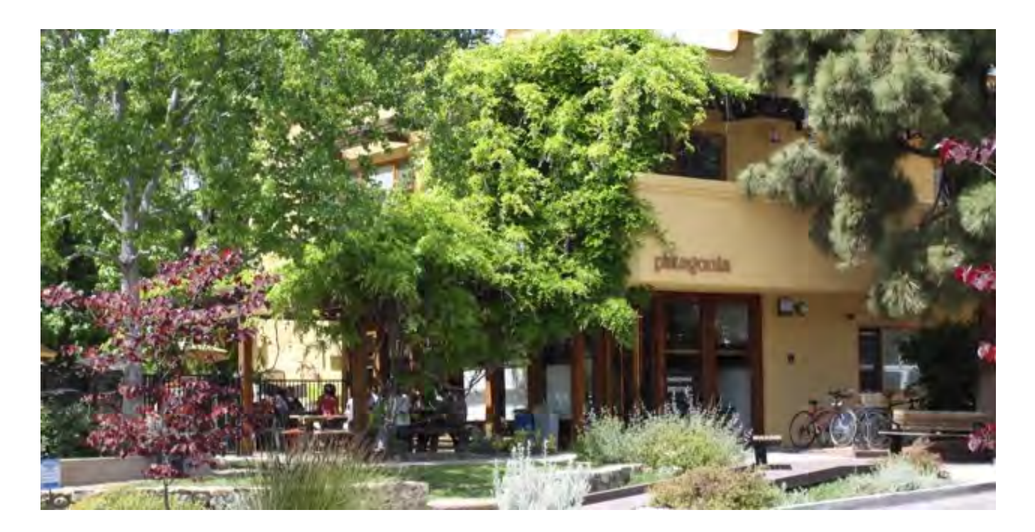
Patagonia's Headquarters in Ventura, California, USA.