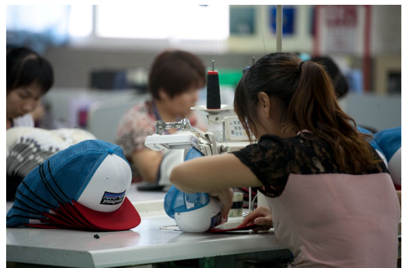
Factory producing Patagonia hats.