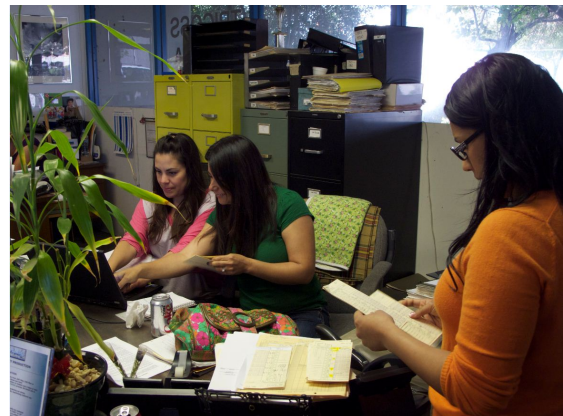
The Social and Environmental Responsibility Team conduct a payroll assessment.