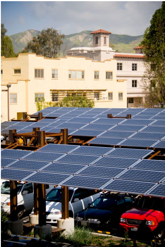
One of two solar arrays at Patagonia’s campus.

By accrediting Patagonia’s labor compliance program, the FLA Board formally recognized that the program fulfilled the requirements set forth by the FLA. The assessment by FLA staff concluded that during the implementation period, Patagonia had aligned its compliance program with FLA standards, benchmarks, and protocols and met all the requirements of FLA participation with respect to its operations and applicable facilities. Patagonia’s accreditation report is available online at http://www.fairlabor.org/report/patagonia-2008-accreditation-report .