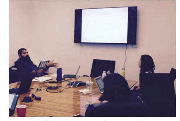
Volcom's Global VP, Supply Chain and Compliance and the FLA's Accountability Associate discussing the social compliance program during the HQ Assessment.

Volcom has reviewed its materials suppliers and the negative impacts delays in deliveries may cause on supplier production. As a result of this review, Volcom