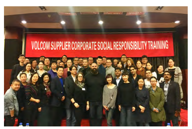
Volcom's 2017 Vendor Global Compliance Summit in Shanghai, China.

Volcom holds an annual Global Compliance Summit for vendors, agents, and suppliers to review its PASS program. FLA observed this summit in 2016 and verified that Volcom reviewed the updates to its program, code of conduct, and responsible purchasing practices. FLA's Regional Manager, East Asia, attended the summit and made a presentation on the FLA and the SCI assessment methodology. During the 2017 Global Compliance Summit, Volcom conducted training on responsible purchasing practices, grievance mechanisms, root cause analysis, and union and worker engagement. This training delved deeply into each topic and included interactive group exercises which led to open discussions between Volcom and its vendors and suppliers. These interactive