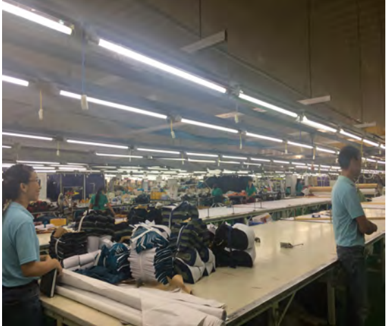
Workers in the cutting department at a Volcom contract factory in Vietnam.

Starting in 2017, the third-party service provider has included, as part of their protocol, verification of remediation progress of findings from previous audits. Information on remediation progress is monitored and analyzed through Volcom's data analysis tool. As a next step to the data collected by Volcom on union and worker representatives, FLA recommends Volcom develop a protocol on consultation with union and worker representatives in the development of remediation plans. FLA emphasizes that it is important for Volcom to understand the relationship between the factory management and the union before being able to support effective collaboration towards effective remediation.