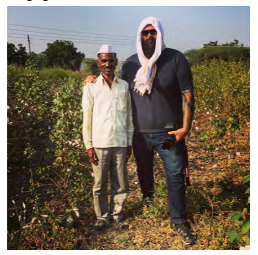
Volcom's Global VP, Supply Chain and Compliance, interviewing a cotton farmer in Aurangabad, India.

In 2017, as part of Volcom's monitoring protocol, the third-party service provider started to engage with organizations through the audit process. FLA verified the third-party service provider had engaged with the local union and the Social Insurance Department during a Field Observation in