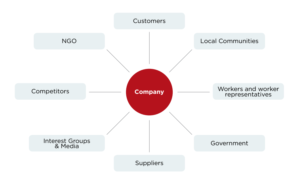
Figure 4: Example of a basic stakeholder map.