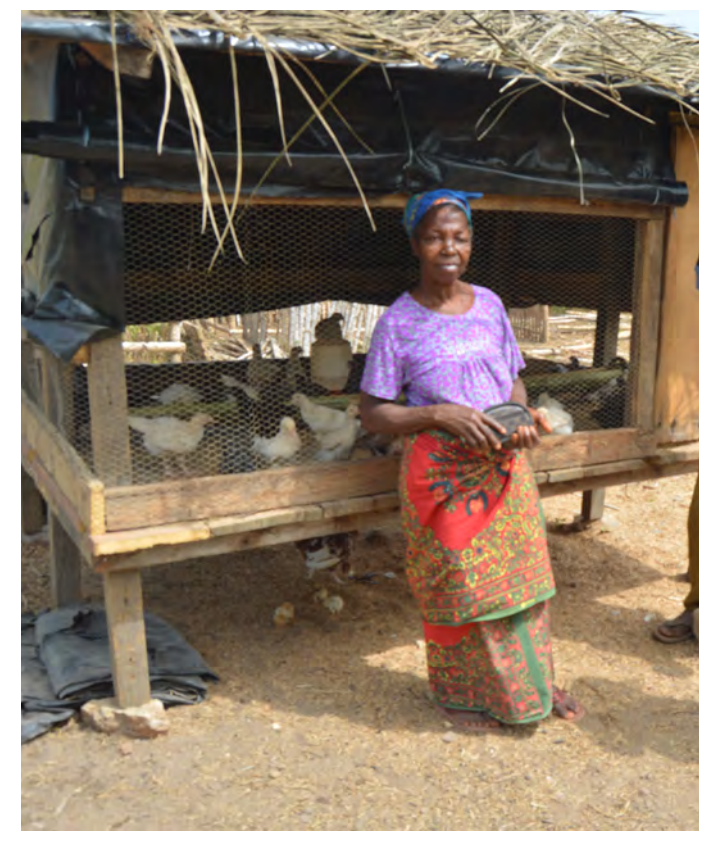
A small ranch of kitchen created by a GALS participant woman in Zaranou