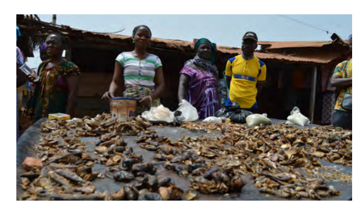
A GALS participant lady from Zaranou performing her small trade of fishes

Additionally, in the upcoming visit, the project staff will continue to build their capacity on economic empowerment strategies (such as marketing). Finally, the project staff will provide community members with guidance on the topic of gender justice and equality.