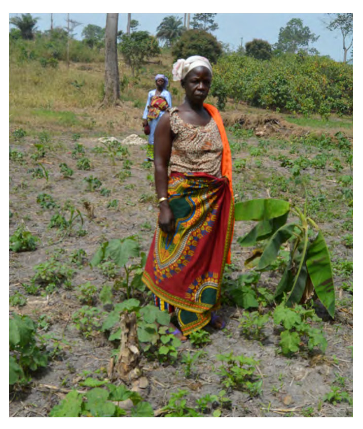
A woman from Zaranou in her okra farm created after the GALS Training

during the training, and to register progress. According to AFEDZ, more than 50 individual participants have initiated additional incomegenerating activities and/or improved their current activities. During the follow-up visit, FLA staff visited the projects of 15 participants (11 women and four men) implemented and/ or improved after the GALS training. These projects include: food crops farming; pig, sheep, and goat ranching; fish farming; ice juice trading; clothes and shoes trading; and miscellaneous food products trading. In addition to these individual projects, a group of women from AFEDZ (about 200 members), supported by the local cocoa cooperative COOPAZA (supplying to Nestlé), is producing food crops and conducting fish farming.