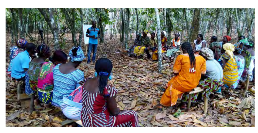
FLA field staff in meeting with women at the farmer field school of Yaokouakoukro

These various levels provide opportunities for women to voice concerns, as and when they are necessary. The role of the FLA is to facilitate the establishment of these structures, strengthen the capacities of the responsible persons, and link such persons