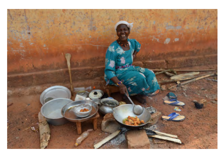
A GALS participant performing her small trade

The women's association AFEDZ is coordinating the work related to this project in Zaranou. The initial training involved a number of community members. The project staff advised the women's association linked to the community to be in regular touch with the training participants, to follow up on implementation on the plans as discussed