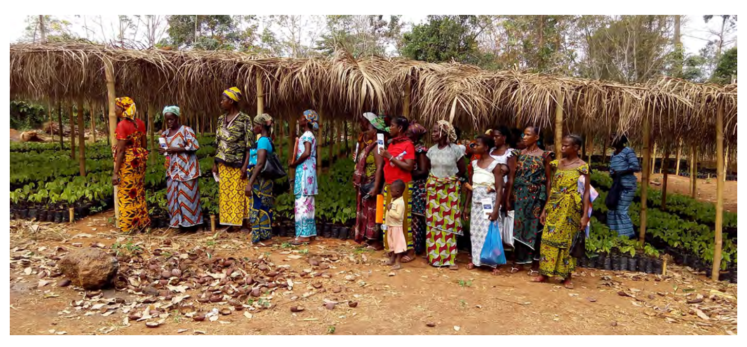
A cocoa nursery funded by Nestlé that is maintained by women from Bah-Mé-Tioh of Yaokouakoukro

on their own, without external assistance. The discussions highlighted that the work they are currently conducting can be self-managed with existing resources, but if these operations need to be scaled up (in terms of better quality, higher yields, and more production area), all individuals will require additional assistance and resources.