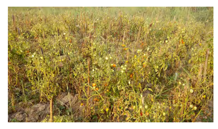
Tomatoes farm of a GALS participant group from Yaokouakoukro

Both communities undertook activities in their respective capacities, with locally-available resources and based on the action plan developed during the initial training session (see Annex 1 for Yaokouakoukro), since August 2015.