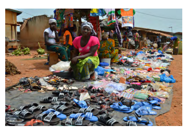
A GALS participant lady from Zaranou achieving her commitment of clothes and shoes trading