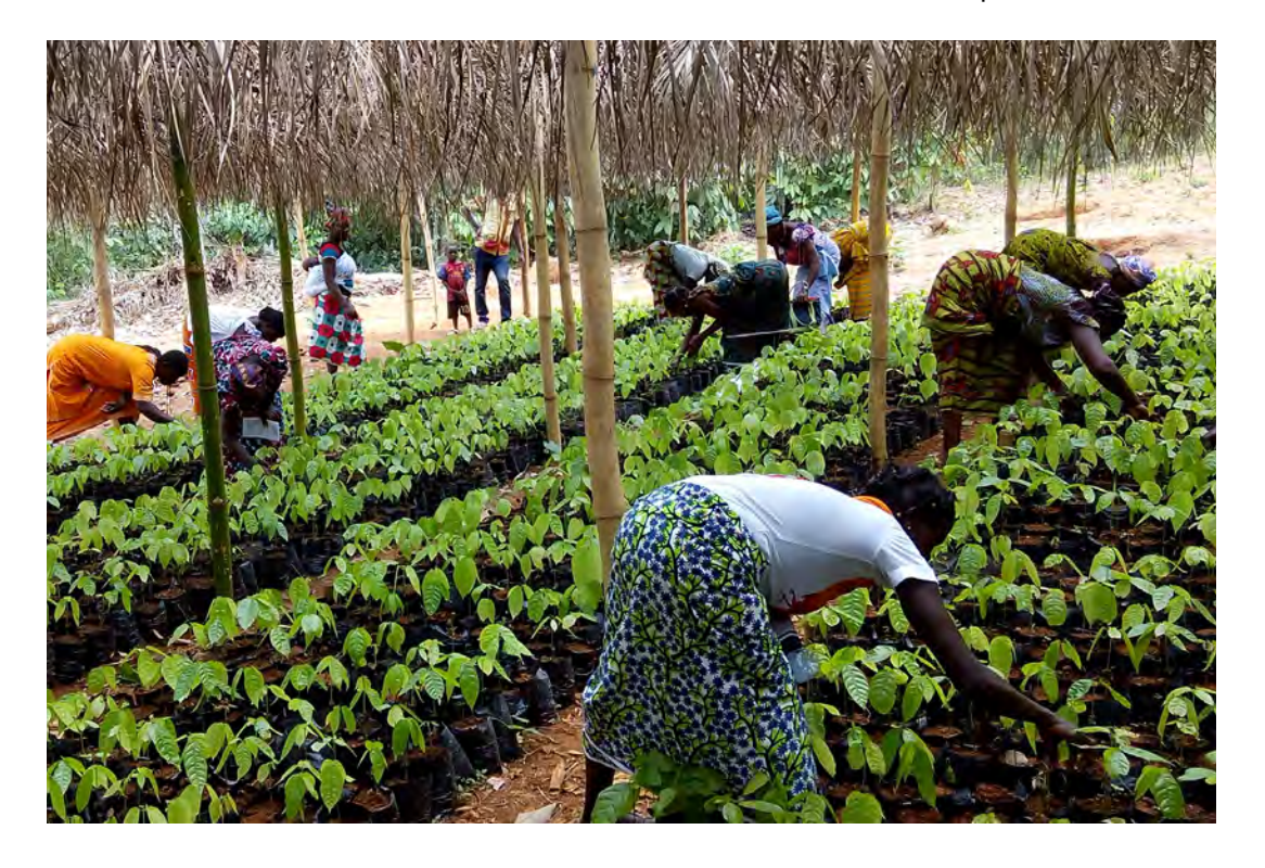
Women from Yaokouakoukro maintaining a womenoriented cocoa nursery funded by Nestlé.

In Yaokouakoukro, FLA staff visited all eight communities linked to this village to monitor the implementation of the group projects commitments made during the initial GALS session. FLA staff observed that all group projects are at various implementation stages: four have started; two are advanced; one is tangible (meaning the produce is being harvested and sold in the market); and one was unsuccessful (due to poor weather, yet is being replaced by another commodity). Annex 1 provides further details.