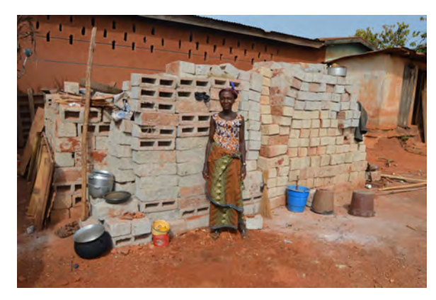
The president of AFEDEZ is building her own house after a commitment made during GALS training