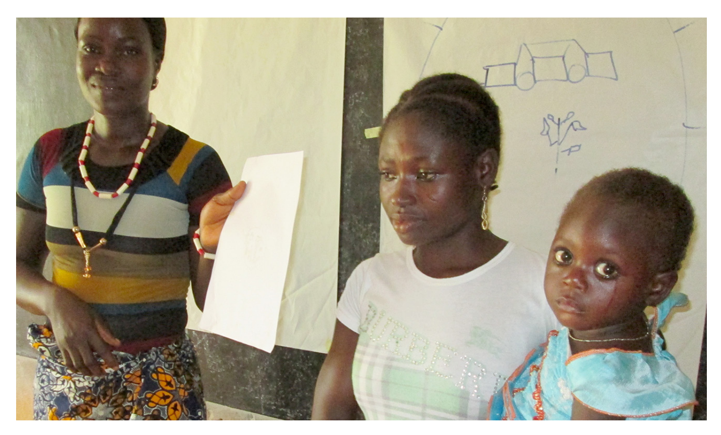
Women presenting their vision.

The workshop used another tool, the Challenge Action Tree, to analyze the eight activities that emerged from the Soulmate Visioning.