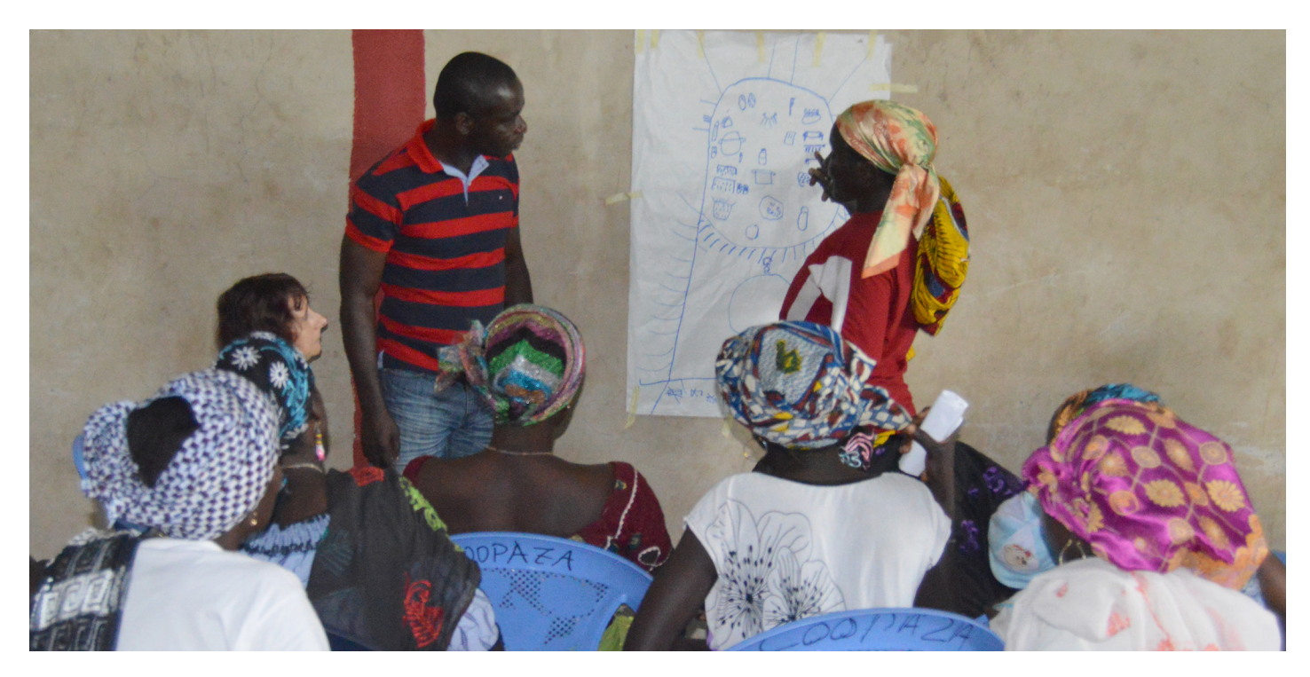
A working group in Zaranou.

means that some women relying drawing for written communications, together with participatory and analytical skills they need to develop their own plans. The GALS methodology needs to focus on developing confidence in these areas first. Once that is done, experience elsewhere suggests the rest can come quite fast.