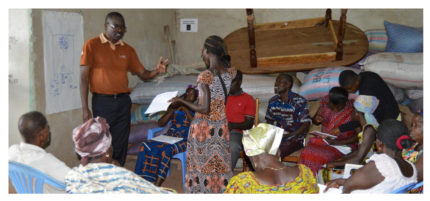
A Working Group during GALS training in Zaranou.