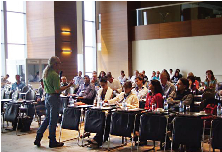
Auret van Heerden opens the 2011 Stakeholder Forum on Wages in Istanbul, Turkey

than looking at wages as a single line item on an audit checklist, it is essential to dig deeper and direct assessors to examine the root causes of unfair wages. Additionally, as the emphasis has been on legal compliance, information has not typically been collected from factories with regard to pay systems, discrimination, unreasonable pay disparities, wage inequalities among staff, and more.